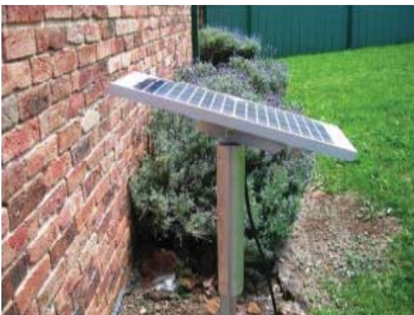
Photo 5 SP22 Solar Panel mounted to star picket

The Solar Panel is supplied with a mounting kit designed to fit the solar panel onto a standard star picket or steel post. At the base of the mount a locking screw is fitted to prevent the panel rotating on the post.