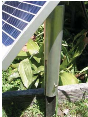
Photo 6 locking screw on base

The angle of the panel is adjusted to suit the angle of the sun using the wing nut and pivot, as shown below. An optional battery pack and solar regulator can be installed just below the solar panel to provide some protection from weather.