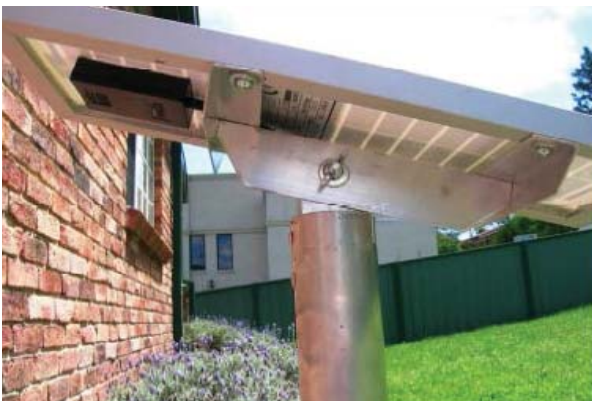
Photo 7 Angle Adjustment

The angle of the panel is adjusted to suit the angle of the sun using the wing nut and pivot, as shown below. An optional battery pack and solar regulator can be installed just below the solar panel to provide some protection from weather.