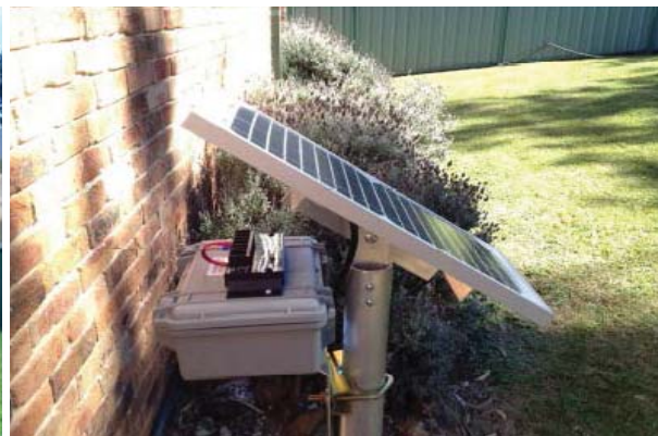
Photo 8 Optional Battery Pack & Regulator fitted

NOTE 19: Solar Panels should always be pointed North in the Southern Hemisphere or South in the Northern Hemisphere