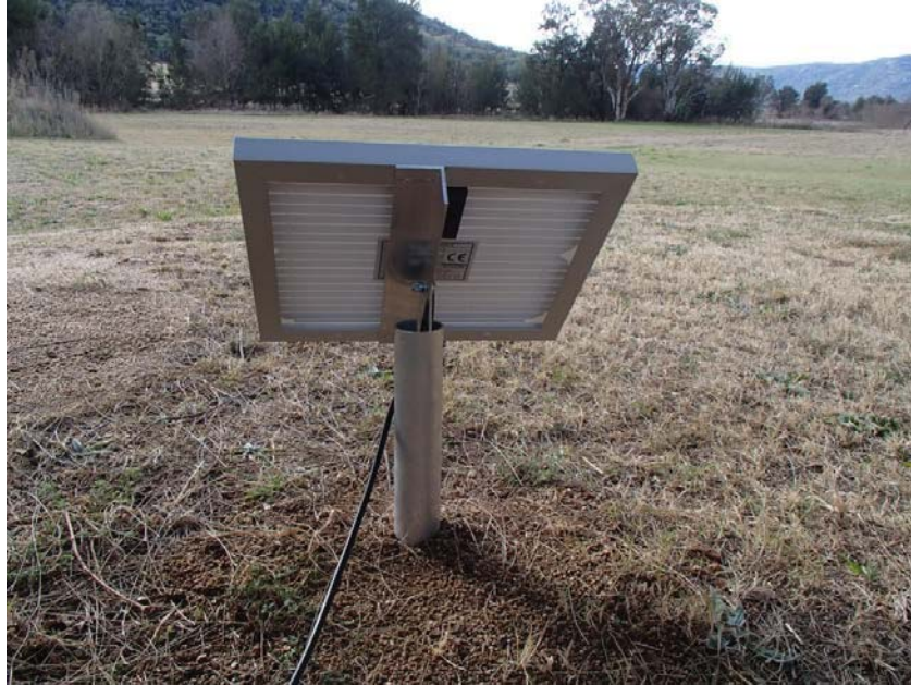
Photo 9 SPPM installed directly in the soil to mount and position a SP22 W solar panel.

The SPPM is designed for mounting on a steel fence post or Star Picket, but can also be attached to larger diameter wooden posts such as Vineyard trellis posts. Alternatively, the upright of the SPPM can simply be dug straight into the soil for autonomous operation. The SPPM can also be attached to a branch of the tree within the canopy to securely install the solar panel at a preferred angle within a well-lit portion of the canopy.