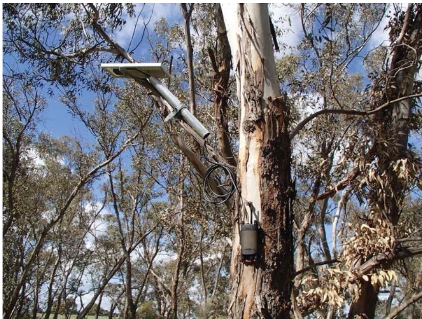
Photo 10: SPPM Solar Panel Post Mount used on the branch of a tree