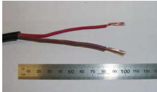
Photo 11 Solar panel cable with the insulating sheaths stripped back to expose the required wire lengths for correct installation in the SFM1

The first step in connection of a panel is to strip the wires to the required length. Remove the outer sheath of the cable from the panel to a length of 100mm. Then strip the individual conductors (wires) and expose the bare copper wires to a length of approx. 20mm.