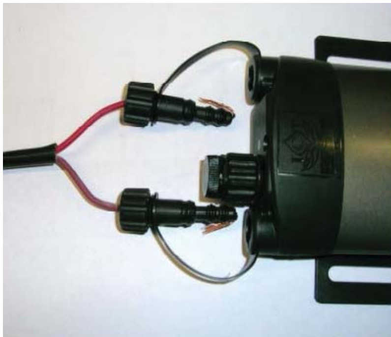
Photo 13 Inserting the power-bus plugs with stripped cable into the power bus ports on either side of the SFM1

NOTE 20: No attempt is made to prevent water ingress into the power-bus tubes. As the gold plated copper pipes run the entirety of the instrument no water that will ultimately ingress along the cable entry, will be able to access the electronics nor will it conduct across between the positive and negative inputs as they are also physically separated on either side of the instrument. Therefore no electrical short can occur. The gold plating of the copper pipe will also prevent corrosion of the pipes and therefore ensure a good electrical connection is maintained throughout the life of the installation.